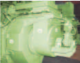
CPM Pellet Mill